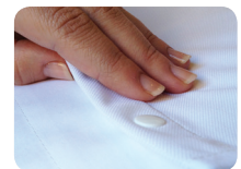
Adjustable press studs