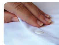
Adjustable press studs